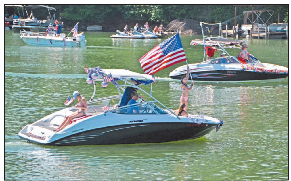
Nottely Marina holds an Annual Fourth of July Boat Parade. 2016 parade participants pictured here.